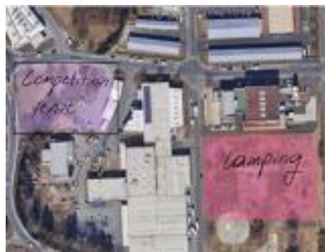
Figure 1: Feature and Camping Area

Camping at venue (10 th of August – 2 nd of September): Around two weeks prior to team trainings, camping is prohibited at the competition area. Instead, paddlers can camp at a camping area about two minutes walking distance from the feature (see picture). The same rules for camping apply.