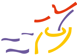
Federación de Piragüismo de Castilla y León