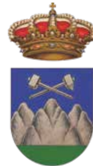
Ayuntamiento de Sabero