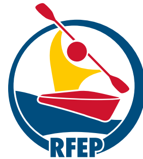
Real Federación Española de Piragüismo